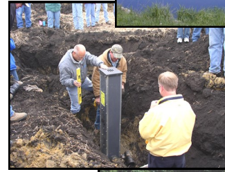
Control Drainage Installation